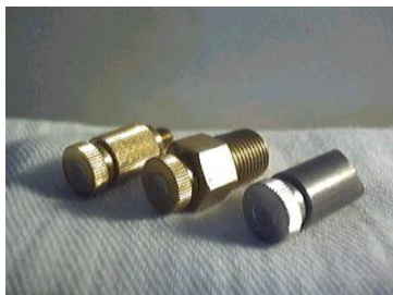
Brass and Stainless Steel Nozzles

Construction and Demolition (C&D) Facilities: The issue faced by C&D Recycling Facilities is clearly dust. Installing a BryCoSystems dust suppression unit, will enable you to bring dust control to not only your facility in general, but to key dust generation points within. The process of tipping in itself can be a major contributor to your dust control needs. However, the processing of materials after they have been tipped is often the biggest issue, such as screening, grinding and shredding. Dust suppression, when installed in key and strategic locations can lead to a safer and healthier environment.