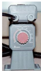
Liquid Metering Pump