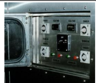
Enclosed Cabinet Control Section