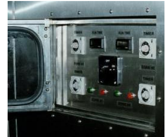
Enclosed Cabinet Control Section